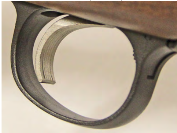
NO recall (Photo 1)