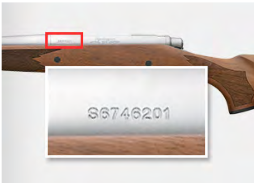
GRAPHIC A: HOW TO FIND YOUR SERIAL NUMBER.